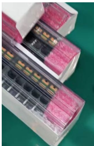
Old version (with foam)