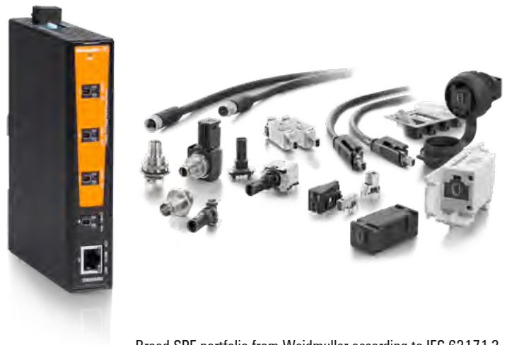
Broad SPE portfolio from Weidmuller according to IEC 63171-2

Last, but not least, testing and certification of devices and components are necessary. Adherence to SPE standards and obtaining relevant certifications ensure interoperability and reliability. Rigorous testing validates performance under various conditions.