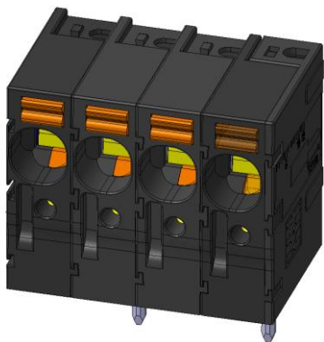
LLFS 90 Old design