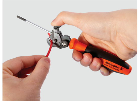
swifty® CS tool set

Ideal for screw and spring clamp terminals, it handles PVC-insulated fine-stranded and solid conductors up to 2.5 mm 2 (14 AWG) and cuts copper conductors — single-stranded up to 1.5 mm 2 (16 AWG), fine-stranded up to 2.5 mm 2 (14 AWG). Whether right- or left-handed — the swifty® CS is suitable for everyone!