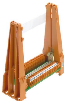
Representative SKH interface