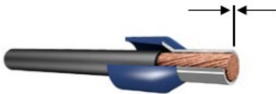
Img. 4: strands looking out of the tube

Additionally, it is essential to select the crimping tool with a suitable crimping shape for the connection point. When conducting the crimp, it is important to note that the crimp should be placed close to the plastic collar ( Img. 6 ).