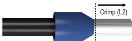
Img. 6: positioning of the crimp

When considering all aspects of this technical information a high quality, non-detachable connection is established between conductor and wire end ferrule.