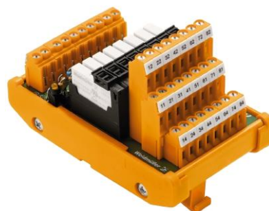
Representative RSMS 8 relay interface